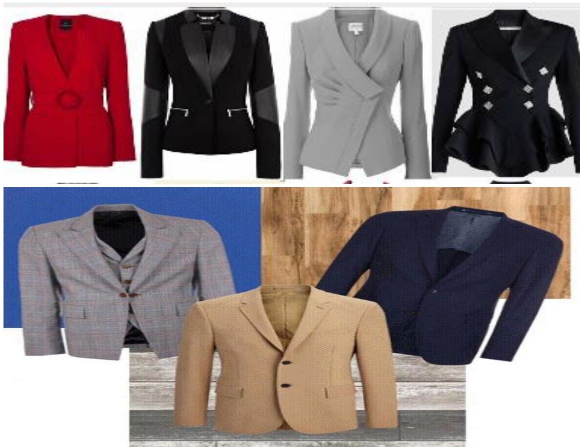
Figure 1. Costumes of different looks

Step 2. To give an idea of the method used to reinforce the topic. For example, to explain the method to the students, the set of costumes shown in Figure 1 is shown first. and the owners of different costumes (persons corresponding to the topic pre-selected by the teacher). Students are divided into groups (if possible, as many costume owners as possible) and given the image of the costume owner (each member of the group chooses one image for himself) and the students have their own opinion as the costume owner. and write their demands. After all the writing, the group discusses and analyzes each other's ideas and problems. Based on the analysis, when the suit is worn for the second time, students write down a few suggestions on the problem and the conditions and tasks required to do so, and give a general conclusion. Each group discusses the topic and its solutions in front of the other groups and draws a general conclusion on all the collected solutions.